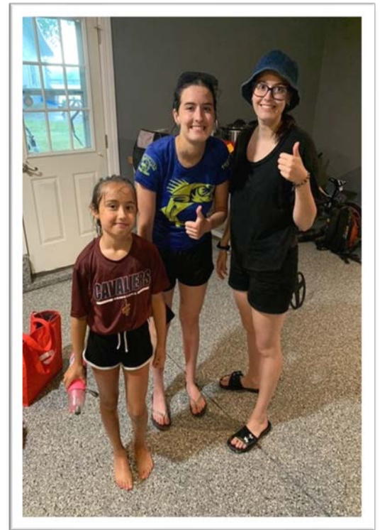
Making memories and getting caught in a pop-up downpour while riding in a golf cart.